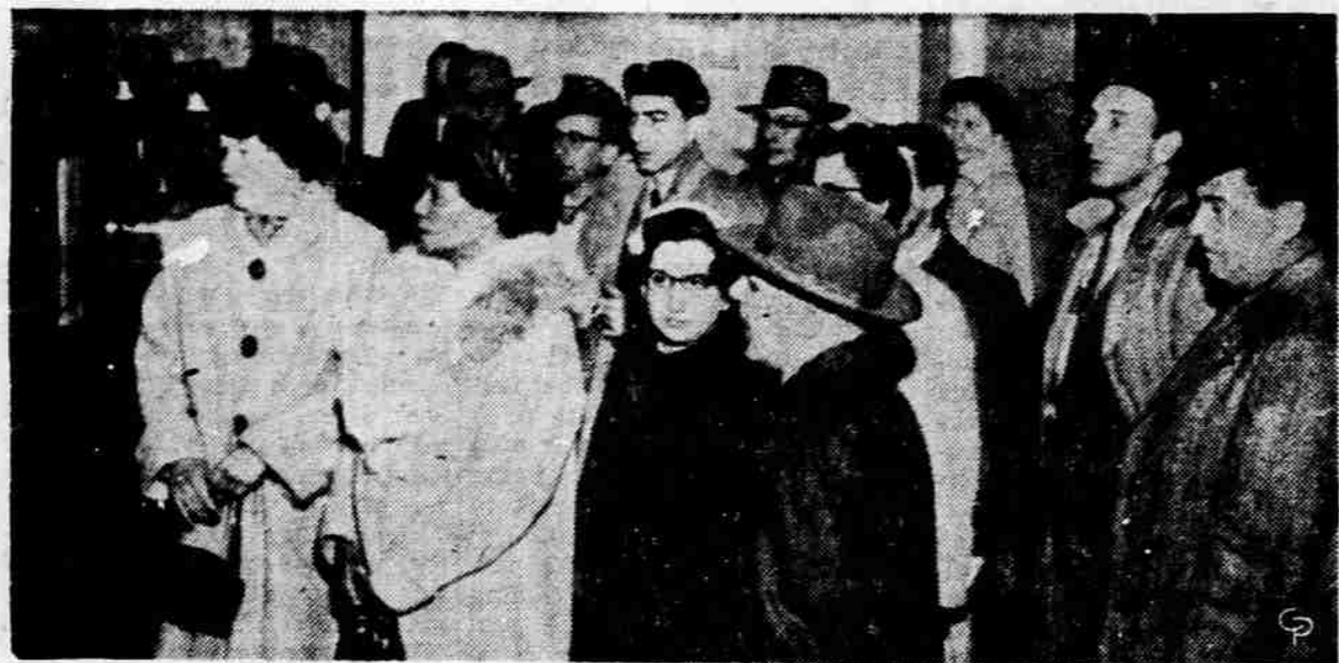
PLENTY OF RED FACES were in evidence when jury trying Dr. Sam Sheppard for slaying of wife, Marilyn, went to Cleveland, O., clerk's office to collect pay, were informed till was bare, they'd have to return later. Incident occurred on fourth day of deliberations.