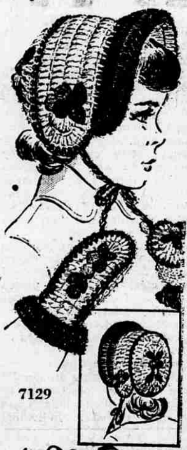
7129 by Alice Brooks

Crochet this adorable set in white with gaily colored flowers—your daughter will look as cute as she's warm! Jiffy—in heavy knitting worked. Send now!