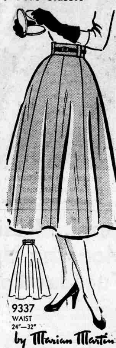
9337 WAIST 24"-32" by Marian Martin

SEW-EASY skirt is also the most flattering and versatile! Your favorite 8-gore classic has just the right amount of flare to look completely new—to mold your hips to a slim, sleek line! Perfect for a casual wool or dressup fabric! Send now!