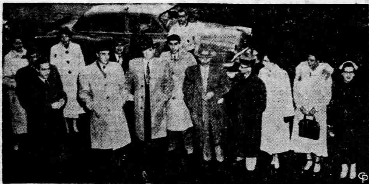
STILL DEADLOCKED over guilt or innocence of Dr. Sam Sheppard, jury arrives at Criminal Courts Building, to continue deliberation after spending night in Cleveland hotel.