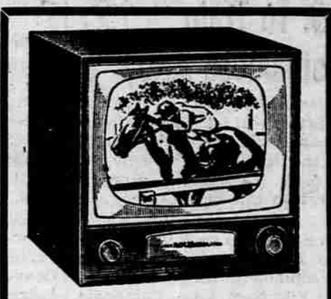
RCA Victor 17-inch Trent. Lowest priced RCA Victor TV. Cabinet 30% smaller than prior models. Ebony finish. Matching "Roll Around" stand on wheels available, extra. Model 17S450.