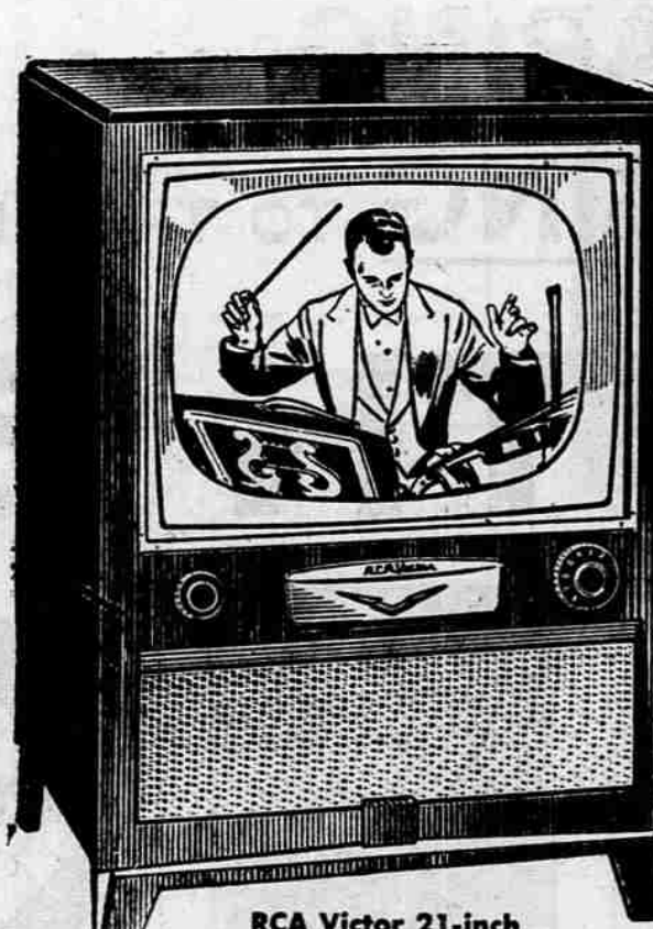
RCA Victor 21-inch Radnor. Strikingly styled, modestly priced. New aluminumized "All-Clear" picture tube. "Easy-See" dial; phono-jack. Grained mahogany finish. Model 21S519.