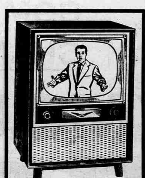
TV WITH HIGH-UP CONTROLS FOR EASY TUNING!

RCA Victor 21-inch Pickford. Striking new "low-boy" console with high-up controls always within easy reach. Twin speakers! Mahogany finish, or in blond tropical hardwood, extra. Model 21S523.