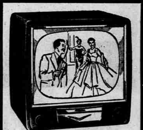
RCA Victor 21-inch Arlen. Smartly styled table model with new aluminumized "All-Clear" picture tube at amazingly low price! Ebony cabinet finish. Matching stand available, extra. Model 21S503.