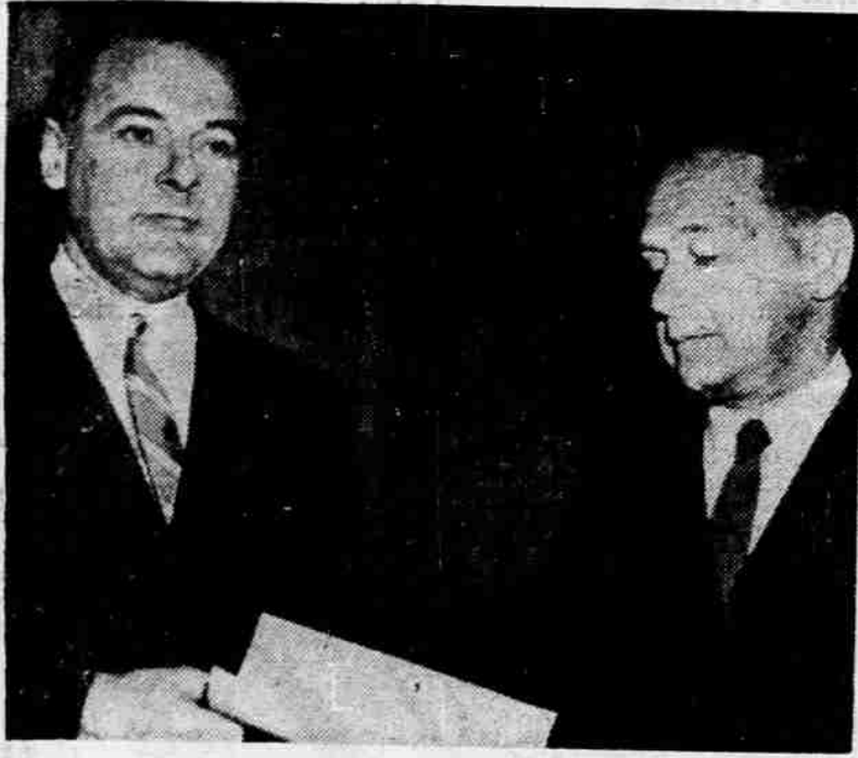
DEMAND RELEASE OF AMERICANS—Chief American UN Delegate Henry Cabot Lodge (left) presents to UN Secy. Gen. Dag Hammarskjold in New York a resolution demanding that Red China release immediately 11 U. S. airmen jailed on "spy" charges in violation of the Korean armistice. The resolution calls on the secretary general to make "by the means most appropriate in his judgment, continuing and unremitting efforts to obtain the release of the airmen."