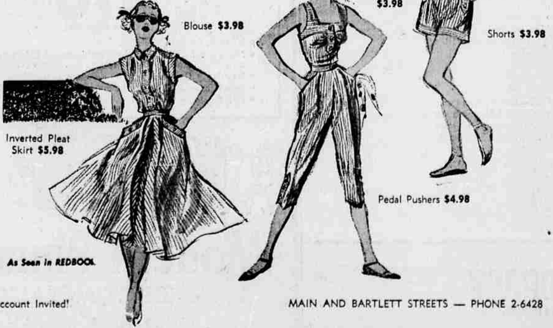
Inverted Pleat Skirt $5.98

Welcome the return of an old love... KORDAY'S seersucker separates for funning, sunning, in town or out. Crisply textured, suds-loving seersucker is perfect for summer's wiling days. Travelers note: KORDAY seersucker never needs ironing. Also available — two-pocket colotte. Lilac, red. Sizes 10-20.