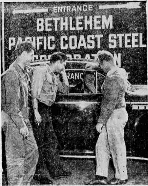
THEY'RE CONCERNED.—Steel strikers picketing the San Francisco plant listen to car radio as President Truman addresses an extraordinary joint session of Congress. The President asked Congress to enact legislation authorizing the Government to seize the steel industry and run it until the contract dispute is settled.