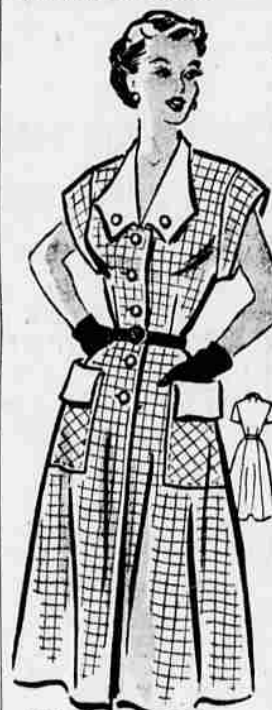
R9116 14½-24½ by Marjann Martin

For the not-so-tall, fuller figure, a taller, slender look! For "over-ninety-degree" days, sparkling-cool white pique trim! And for the busy homemaker, a half-sizer, you can sew up in your spare time—no alteration worries!