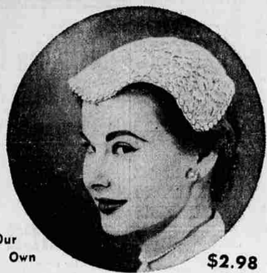
Our Own $2.98

JULIETTE Angelic little cotton lace shell cap. Enchanting and preciously feminine . . . the kind of hat you dream of but seldom see at our low price.