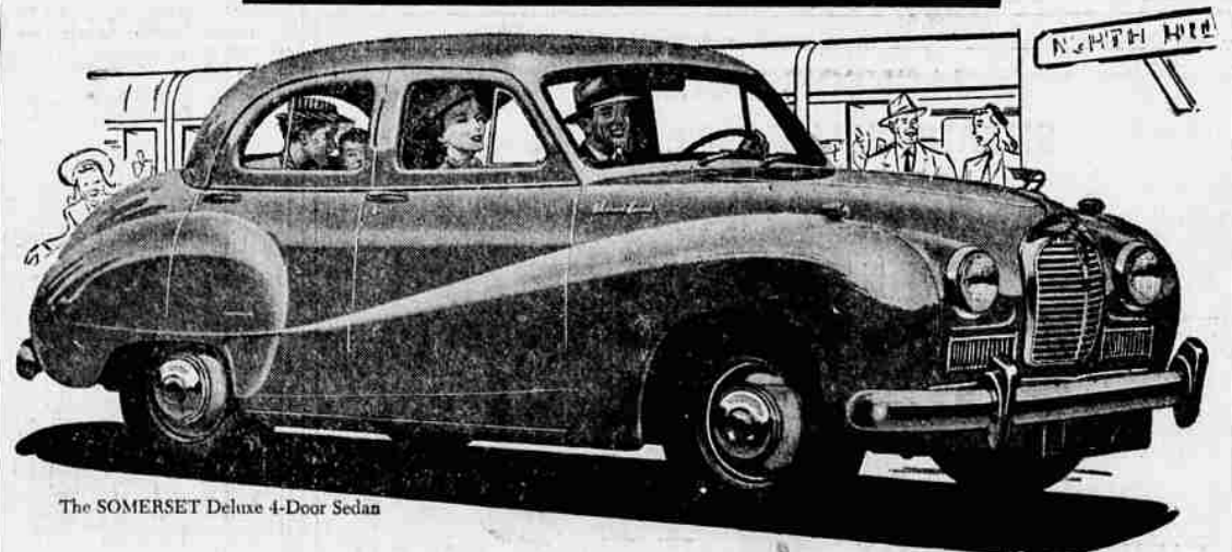
The SOMERSET Deluxe 4-Door Sedan

COMPARE THE ALL NEW 1952 Austin WITH ANY OTHER CAR!