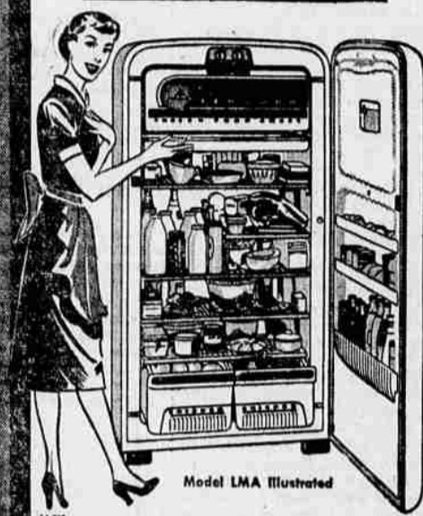
Model LMA Illustrated