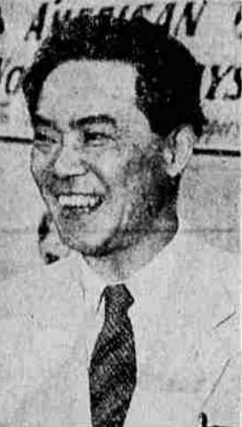
JAPANESE SNOWMAN—Professor Ukihiro Nakaya, who saws snowflakes in half, smiles as he alights from a Pan American Clipper in San Francisco. Recognized as the greatest authority, he will work at the Snow, Ice and Permafrost Research Establishment in Wilmette, Ill., at the invitation of the Government.