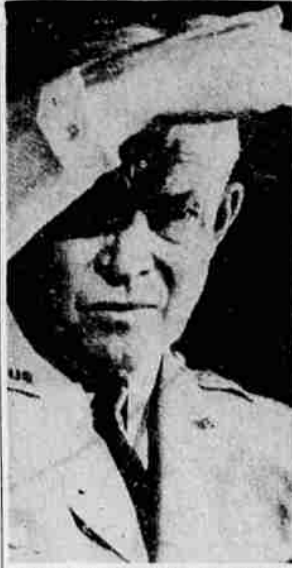
WHO SAID THAT?—Gen. Dwight D. Eisenhower shades his eyes from TV and movie lights as he peers ahead to see his questioner during a press conference at the Pentagon in Washington. It was his last press conference in military uniform.

"Today the most modern method of gold recovery is the cyanide method. Briefly, it uses a solution of cyanide to dissolve the gold sulphides and then, through a zinc recovery process, chemically changes the gold to another form which is easily refined. By this method as high as 92 percent of the gold is recovered.