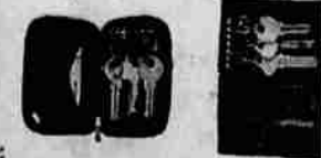
MATCHING KEY CASE