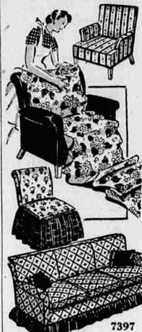
7397 Alice Brooks

Redecorate this thrifty way! Easy too—you fit the covers right on the furniture! These budget-wise instructions take you step-by-step through the making of stunning new covers!