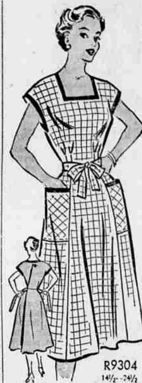
by Marianne Martin

Summer Wonder! Make the Backwrap quickly, easily — it's cool for cooking, cleaning—perfect to wear marketing tool! No fitting problems, it wraps! No ironing problems, it opens flat. Remember, it's a half-size, made for your shorter-waist, fuller figure.