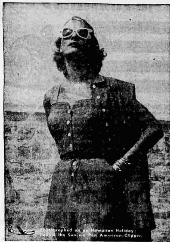
Play suit... button trimmed, all-in-one $7.98. Stroller Jacket... note sleeveless news, little boy collar $7.98. (As seen in Vogue magazine)