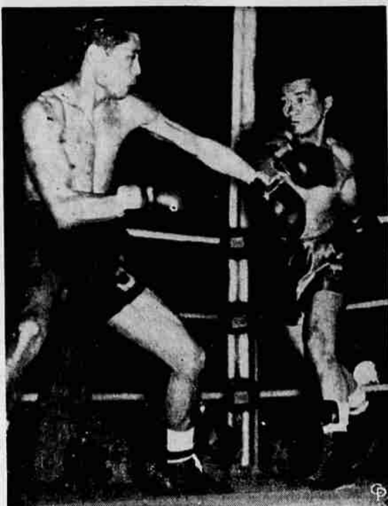
WARLING OFF RIGHT HOOK from Dado Marino, world's fly-weight champion, Yoshido Shirai (left) appears fresh during bout in which he won title by unanimous decision of judges. He is first Japanese to win world crown.