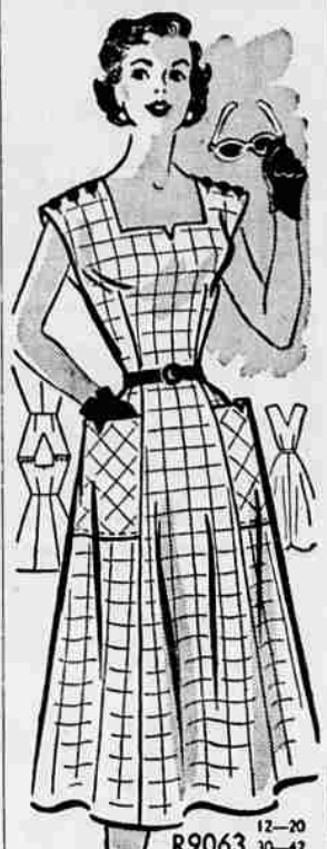
R9063 12-20 by Marian Martin

Buttoned shoulderline is fashion news on this air-cooled cotton! Square neckline in front plunges to a deep V in back so you can soak up the most sun! Quick sewing diagram shows you how easy it is! Graceful flared skirt.