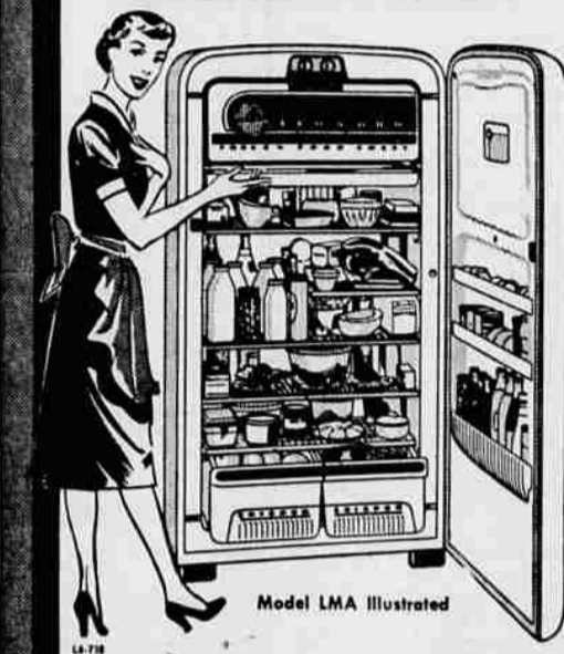
Model LMA Illustrated