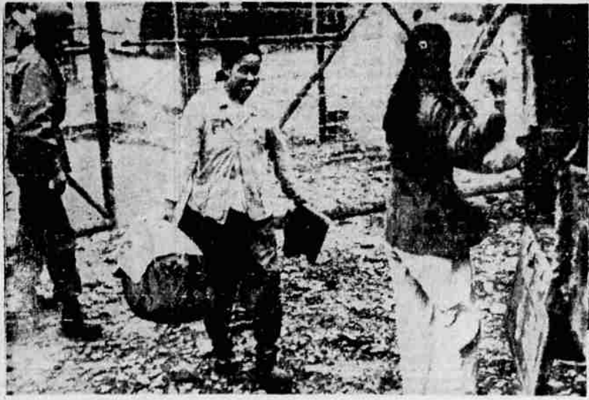
WOMEN'S PREROGATIVE THE WORLD OVER — Communist women prisoners of war on Kojia Island flatly refused medical treatment a few days ago. Exercising their right to change their minds, these prisoners climb into a truck en route to the camp hospital for minor medical attention. American guard (left) is closing the compound gate behind them.