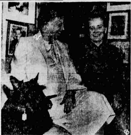
VISITING AT HYDE PARK after being named "Mother of World" for 1952, Senora Rosa Markmann de Gonzales Videla, wife of Chile's President, chats with Mrs. Eleanor Roosevelt (left) at Val Kill cottage after laying wreath on late President's grave.