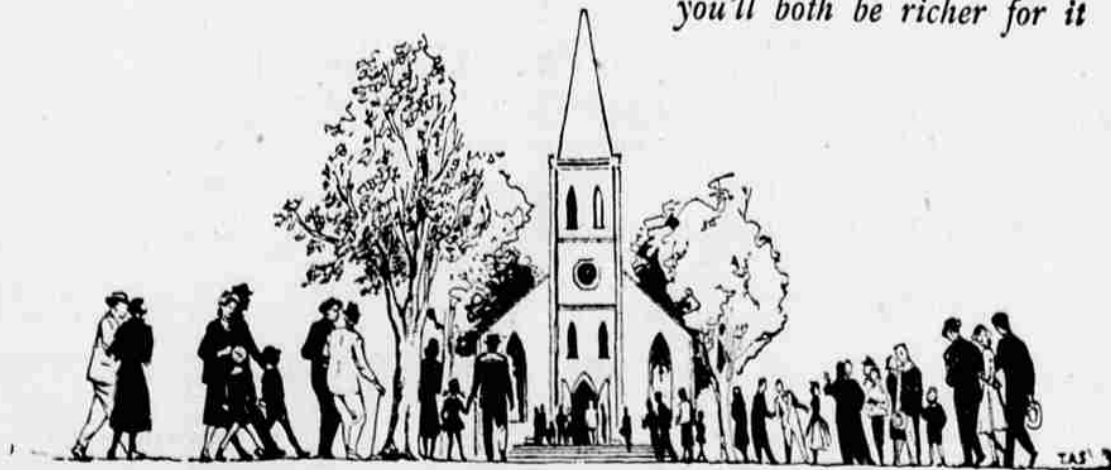
Contributed in behalf of the Religion in American Life Program by

Take someone to church this week . . . you'll both be richer for it