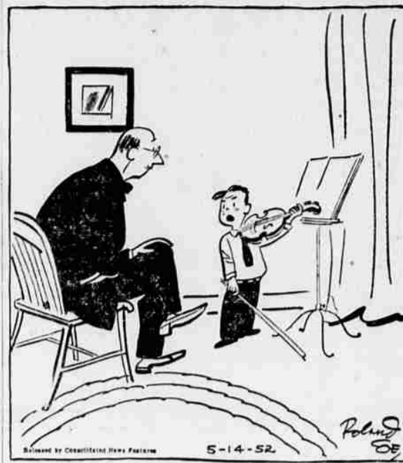
"Frankly, Professor, this is just a whim of my mother's. She's always starting something I never finish."