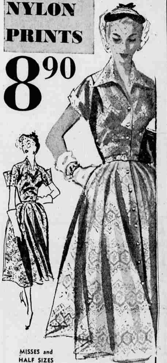
MISSSES and HALF SIZES

Nylon sheer prints—for the easy life! A cinch to wash, quick to dry, little or no ironing! And 8.90 is low for these glamour sheers. Hurry while there are lots of fresh, colorful summer prints!