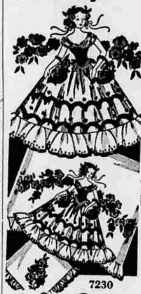
7230 by Alice Brooks

Twenty-four motifs in color! Old-fashioned girls and little nosegays in soft pink, blue and green. Iron them on—no embroidery needed! Washable—use them on towels, sheets, pillowslips, all linens. Just add ready-made eyelet for edging! Pattern 7230 has 24 three-color motifs from 1x2 to 4 1/2x10 inches. Send Twenty-five Cents in coins for this pattern to the Medford Mail Tribune, Household Arts Dept., P. O. Box 5640, Chicago 80, Ill. Print plainly NAME, ADDRESS and PATTERN NUMBER.