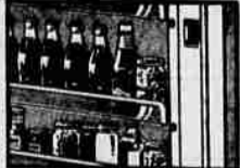
New! Handy Spacemaker Door Shelves! For storing beverages and other much-used items!