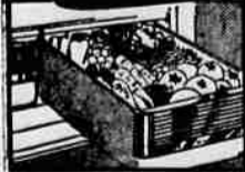
New Roll-Overward Give you 36-bushel capacity. Glide easily in and out!

The bottom compartment is a big, 8-cubic-foot refrigerator that NEVER NEEDS DEFROSTING! Gives you "Moist Cold" — keeps even uncovered dishes fresh and crisp. So many wonderful features, too!