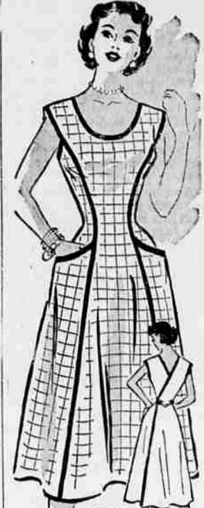
R9393 12-20; 40 by Marian Martin

Shopping? Sunning? Housework? You couldn't look slimmer, smarter—feel more comfortable than in our easy-sew, easy-iron wrap-on. Slip into it without mussing your hair too! Princess lines, flattering U-neckline, back buttons, contrast trim! Pattern R9393; Misses' Sizes 12, 14, 16, 18, 20; 40. Size 16 takes 4½ yards 35-inch fabric. This easy-to-use pattern gives perfect fit. Complete, illustrated Sew Chart shows you every step. Send Thirty-five cents in coins for this pattern to Marian Martin, care of Mail Tribune, Pattern Dept., P.O. Box 6740, Chicago 80, Ill. Print plainly YOUR NAME, ADDRESS, SIZE and STYLE NUMBER.