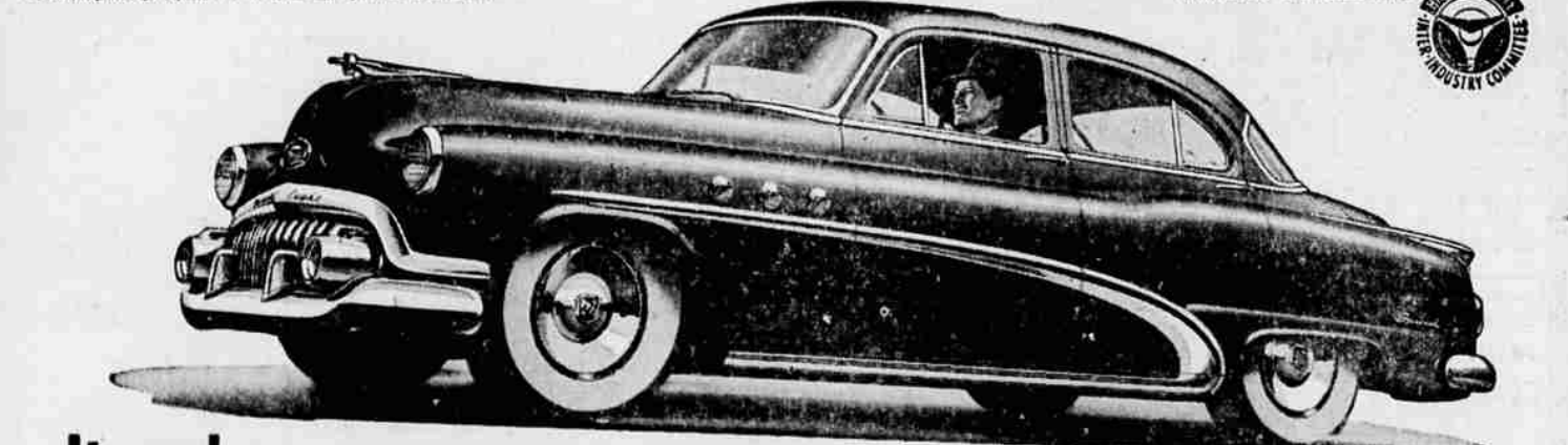
4-door, 6-passenger Special. White sidewalls optional at extra cost.

LOOK ON Page 3 SECTION TWO TODAY FOR GROCERIA SAVINGS!