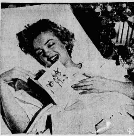
RECOVERING FROM OPERATION, glamorous Marilyn Monroe of films reads "get well" card from Joe Di Maggio, ex-Yankee slugger, who is reported more than casually interested in her. Flowers in Hollywood hospital room also came from Joe.

"I felt pretty low when I came back home from Cincinnati the other night," he recalled, referring to the resignation he submitted to National league President Warren Giles.