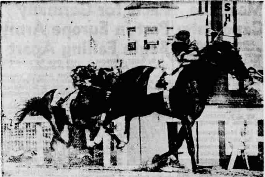
HILL GAIL PULLS AHEAD —Jockey Eddie Arcaro, aboard Calumet Farm's Hill Gail, looks back as he crosses the finish line in the Kentucky Derby ahead of Sub Fleet. Sub Fleet put in a strong challenge in the stretch. Blue Man finished third. Hill Gail's time was 2:01 3/5 for the mile-and-a-quarter.