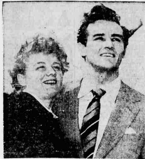
READY FOR WEDDING —Actress Shelley Winters and Vittorio Gassman of Italy are shown as they left Hollywood for Juarez, Mexico, where they will wed if Gassman's Mexican divorce is granted. The couple met in Rome.