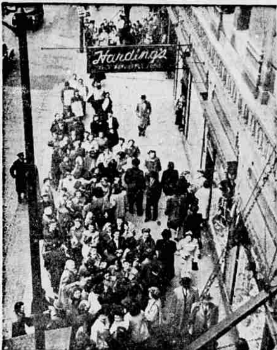
SHORT ON LONG DISTANCE —Some long distance telephone service from Chicago was interrupted when the C. I. O. operators refused to cross the picket lines of striking Western Electric Co. employees. Picketing activities like this shown in Chicago's Loop resulted in half the long distance operators remaining off the switchboards.