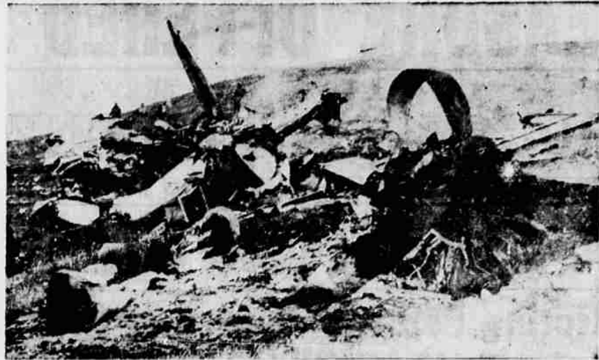
AT LEAST 28 PERSONS DIE IN CRASH—All that remains of the North Continent Airlines C-46 after it crashed in the Puente Hills near Los Angeles. The non-scheduled airliner, flying from New York to Los Angeles, carried at least 28, possibly 30, persons to their deaths.

Washington — (U.P.) — National Production Authority officials said Tuesday the ban on building amusement and recreation projects may be lifted this summer or fall. They said no final decision has been reached and the action may be postponed if the demand for materials for "more important" types of commercial construction proves bigger than now indicated.