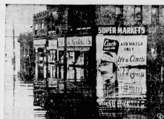
GRIM JEST FEATURES SIGN on Sioux City, Ia., store as Missouri River rises inexorably toward greatest flood level in generation, forcing thousands from homes.

Fourteen privately owned toll roads still exist in the United States, most of them access roads to mountain tops or seashore resorts. Their total length is 7 1/2 miles.