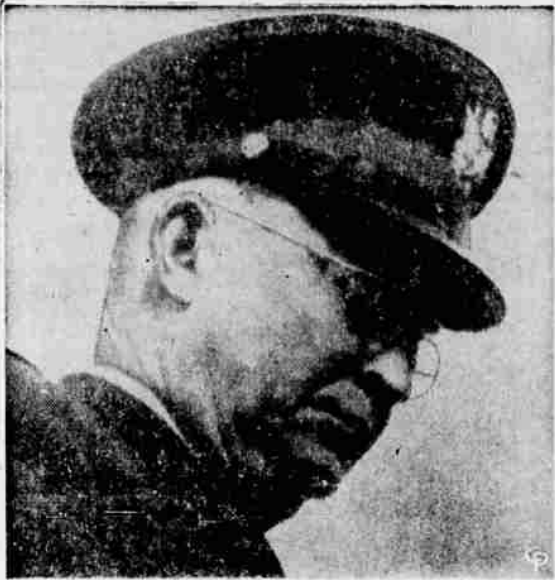
CONCENTRATING ON FIGURES, General Dwight D. Eisenhower is in serious mood as he studies results of New Jersey presidential primary in which he won minimum of 31 of 38 delegates. Picture was made at Paris airport before he flew to Brussels.