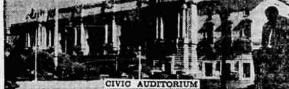
BISHOP BAKER Los Angeles