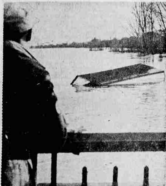
RED RIVER RAMPAGE —Floodfighter watches as a building, torn loose by the ever-rising flood waters of the Red River, floats downstream past inundated Winnipeg, Canada. Thousands have left the city and thousands more are preparing to leave as the wild river continues to rise.