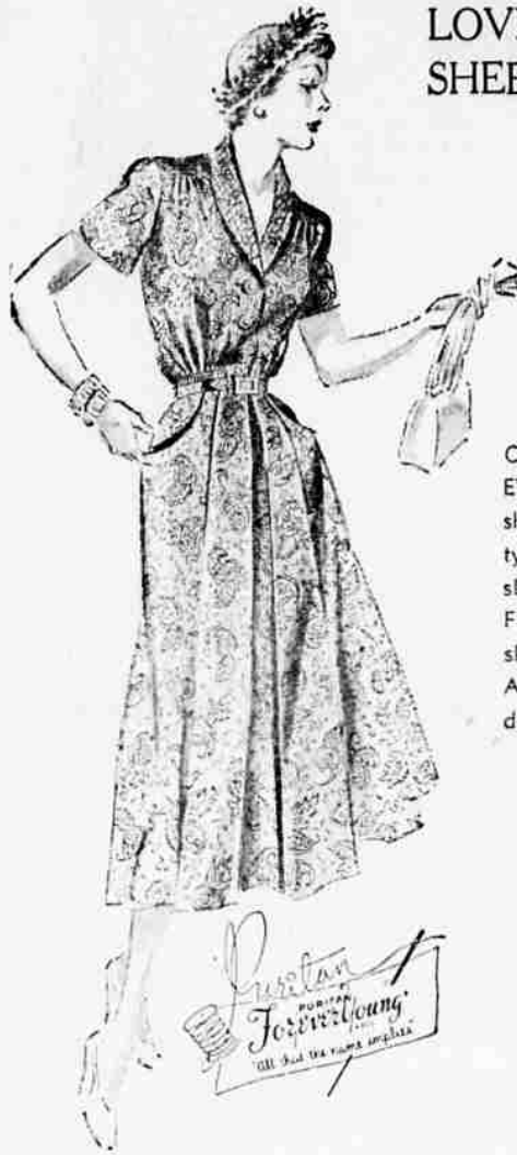
Pictured on the left a cool fine Cotton Voile Frock by "FOREVER YOUNG." This adorable dress is in a Paisley pattern. Soft shades. Smart flattering lines for any figure type. Sizes 16 1/2 to 22 1/2.

HERE ARE DRESSES MOTHER WILL LOVE — COOL SUMMER RAYON SHEERS & COTTON VOILES.