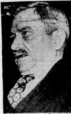
TESTIFIES — Earl Browder (above), former boss of American Communists, is shown as he told Senate Communist investigators in Washington that Louis F. Budenz' sworn testimony was "false" when he said Browder had termed Owen Lattimore a Communist.