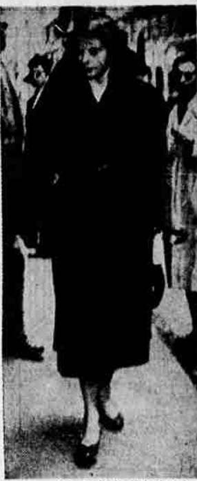
STROLLS UNNOTICED — Movie actress Ingrid Bergman (above) strolls through the streets of Rome alone and apparently unnoticed during a shopping tour. It was her first public appearance since giving birth to director Roberto Rossellini's baby.

The air force plans to have four B-36 bomber groups, regardless of the total number of groups it is allowed of all types, and two B-36 reconnaissance groups. Plans call for 159 bombers, 30 per group and 39 spare planes. The two reconnaissance groups are scheduled to have 36 airplanes each. These figures indicate that additional planes will have to be ordered. B-36's are to be the mainstay of the strategic air command, an arm of the air force but under joint chiefs of staff direction. Its mission in a war would be to carry out an immediate atomic bombing offensive. The B-36 has a 10,000-mile range. Here is the cost history of the B-36 program: Design competition in 1941, $435,623; two experimental models ordered in 1941, $39,475,234; first production order, 1944, 95 planes, $445,777,227; second order, 1949, 39 planes, $172,949,000; modification of 94 planes of first order, 1949, $147,846,000; third order, 1949, 36 planes, $182,021,490; revised estimate of cost of program in 1949, indicated additional need for $33,000,000; fourth order, fiscal 1950, 47 planes, $267,800,000. Total, $1,289,306,574. The share of the prime contractor, or manufacturer, Consolidated Vultee Aircraft Corp., is estimated at 40 to 45 per cent of the total. The remainder pays for engines, propellers,