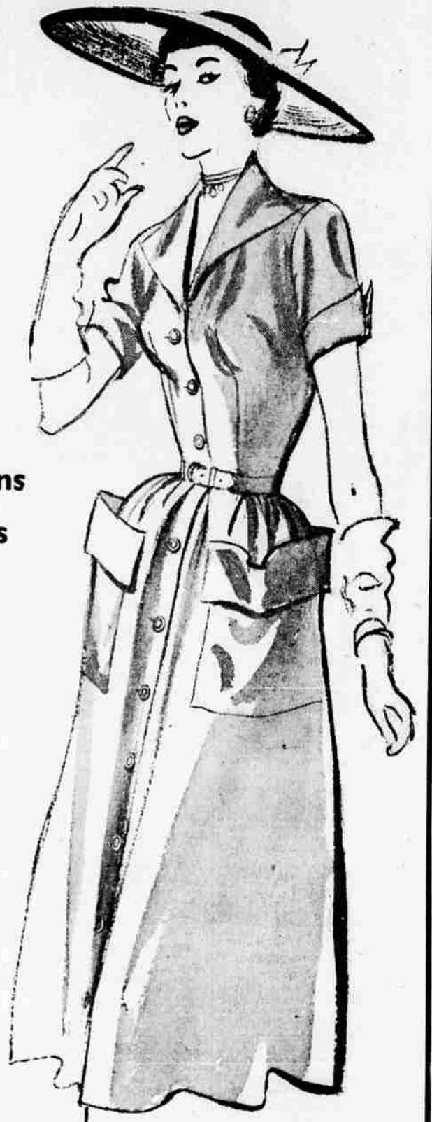
Acetate Rayon and Nylon