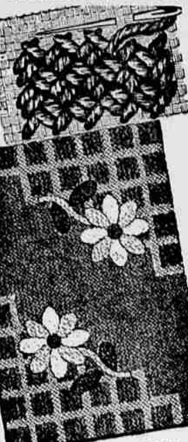
Alice Brooks 7240

No easy, quick-to-do needlework! This rug is embroidered in rug yarn on monk's cloth—in just the herringbone stitch.