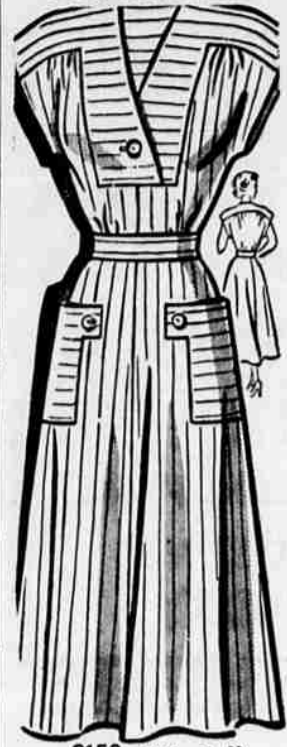
9153 SIZES 34-50