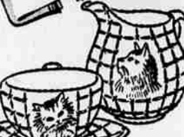
7470 Alice Brooks

Make your kitchen a prettier place to spend your time! Here are towel motifs for that very purpose, all simplest embroidery.