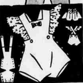
9065 SIZES 2-8 Marian Martin

Send her off to party or picnic, Mother, dressed just right! Skirt buttons to sunsuit, whisks off for active games. Couldn't be easier to sew, sunsuit opens to iron!