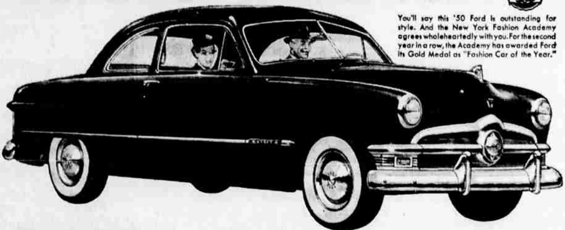
You'll say this '50 Ford is outstanding for style. And the New York Fashion Academy agrees wholeheartedly with you. For the second year in a row, the Academy has awarded Ford its Gold Medal as "Fashion Car of the Year."