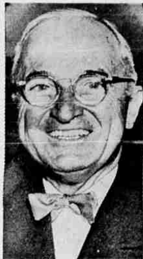
ANNIVERSARY—Deeply thanked from his recent Florida vacation and apparently in tip-top shape, President Truman presents this smiling picture as he begins his sixth year in the White House. The President will celebrate his 66th birthday on May 8.