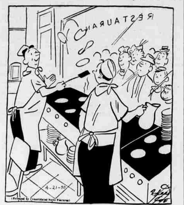
"They offered me a job in the kitchen, but I like an audience."