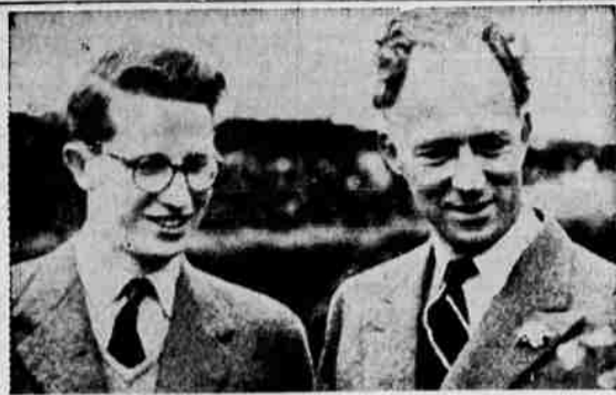
ROYAL BELGIAN ROW —Latest photo of Belgium's Prince Leopold (left) and father, King Leopold, whose latest proposal to settle bitter row over his return to throne has only further confused situation. Leopold said he was willing to transfer power "temporarily" to his son. Even the pro-Leopold Social Christian (Catholic) Party said the offer was unsatisfactory.