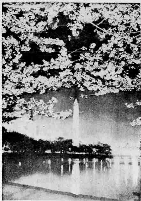
WASHINGTON BLOOMS — Changeable spring weather brought Washington's famed cherry blossoms out late this year and now will subject them to near freezing temperatures for a few days. Despite unspring-like thermometer readings, the blossoms do enhance the beauty of the Washington Monument.