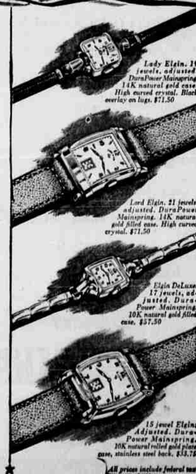
Lady Elgin, 19 jewels, adjusted, DuraPower Mainspring, 14K natural gold case, High curved crystal, Black overlay on lugs. $71.50