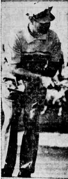
MASTER GOLFER —Jimmy Demaret of Ojai, Calif., watches his put on the 17th green in the Masters' Tournament at Augusta, Ga. Demaret won with a final round of 69, for a four-day total of 243.