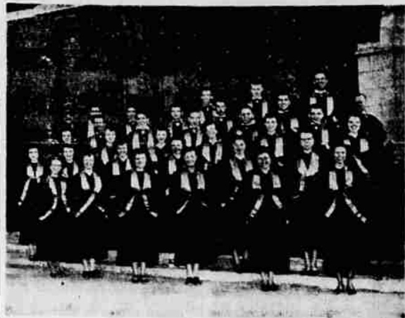
SINGS HERE SUNDAY—The A Capella choir of Northwest Nazarene college, shown above, will present a sacred music concert at 7:30 p.m. Easter Sunday in the local Church of the Nazarene. The public is invited to this concert.