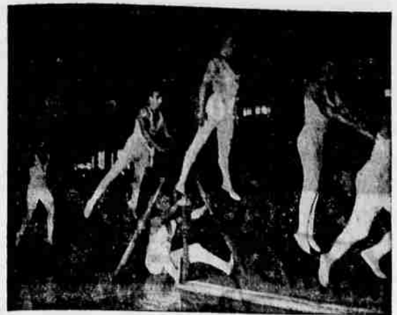
GYMNASTS SHOW HERE TUESDAY —The famous Danish gym team will present an eight event program in the senior high gymnasium here Tuesday night, April 11 with 16 young men and as many young women taking part. Shown above are some of the men members going over the "horse" in rapid succession. Proceeds will go toward the school athletic fund.