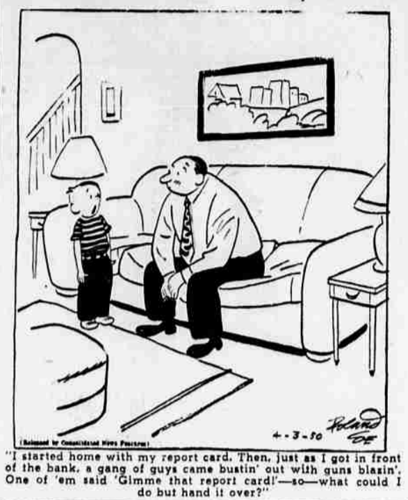
"I started home with my report card. Then, just as I got in front of the bank, a gang of guys came bustin' out with guns blasin'. One of 'em said 'Gimme that report card!'—so—what could I do but hand it over?"