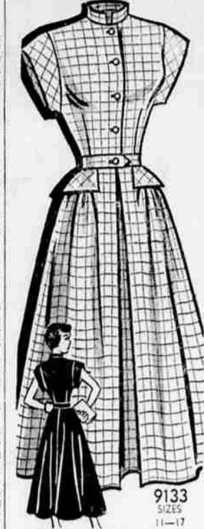
Marian Martin 9133 5125 11-17

Breeze through the making of this versatile little casual! Can be a daytime darling or most pertified according to the fabric. You'll love the Mandarin collar, cluster-gathered pleated skirt!