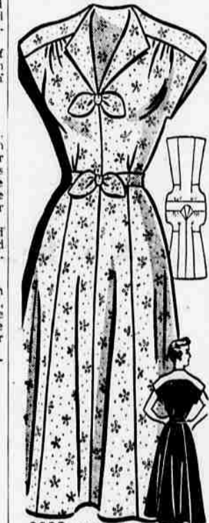
9099 SIZES 34-52 Marian Martin

The newest in flattering is yours with this dress. From the smooth shoulder-yokes to the graceful paneled skirt, every detail is planned to make you look slim!